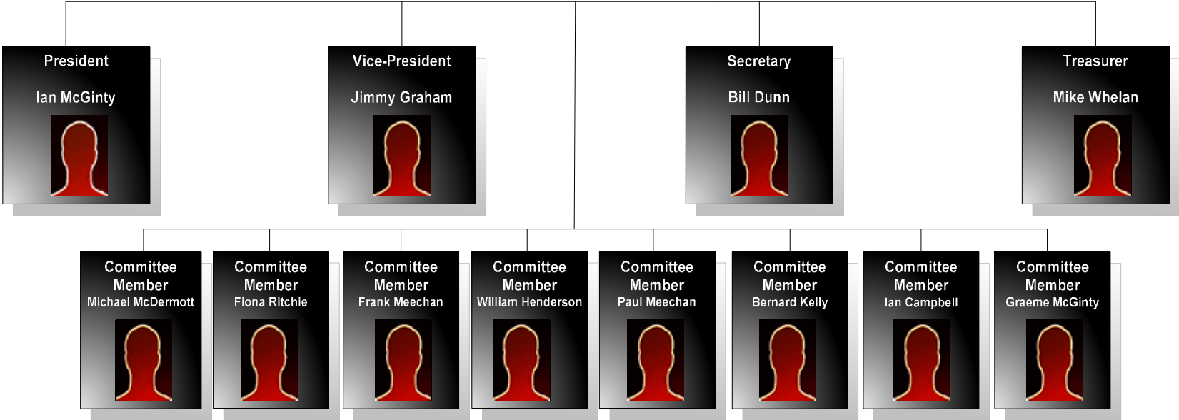
Blackburn United CFC Adult Section Structure